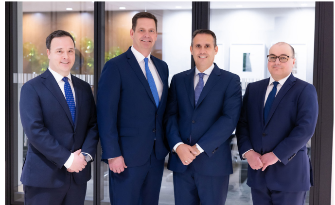
MK Total Wealth Management Group TD Wealth Private Investment Advice